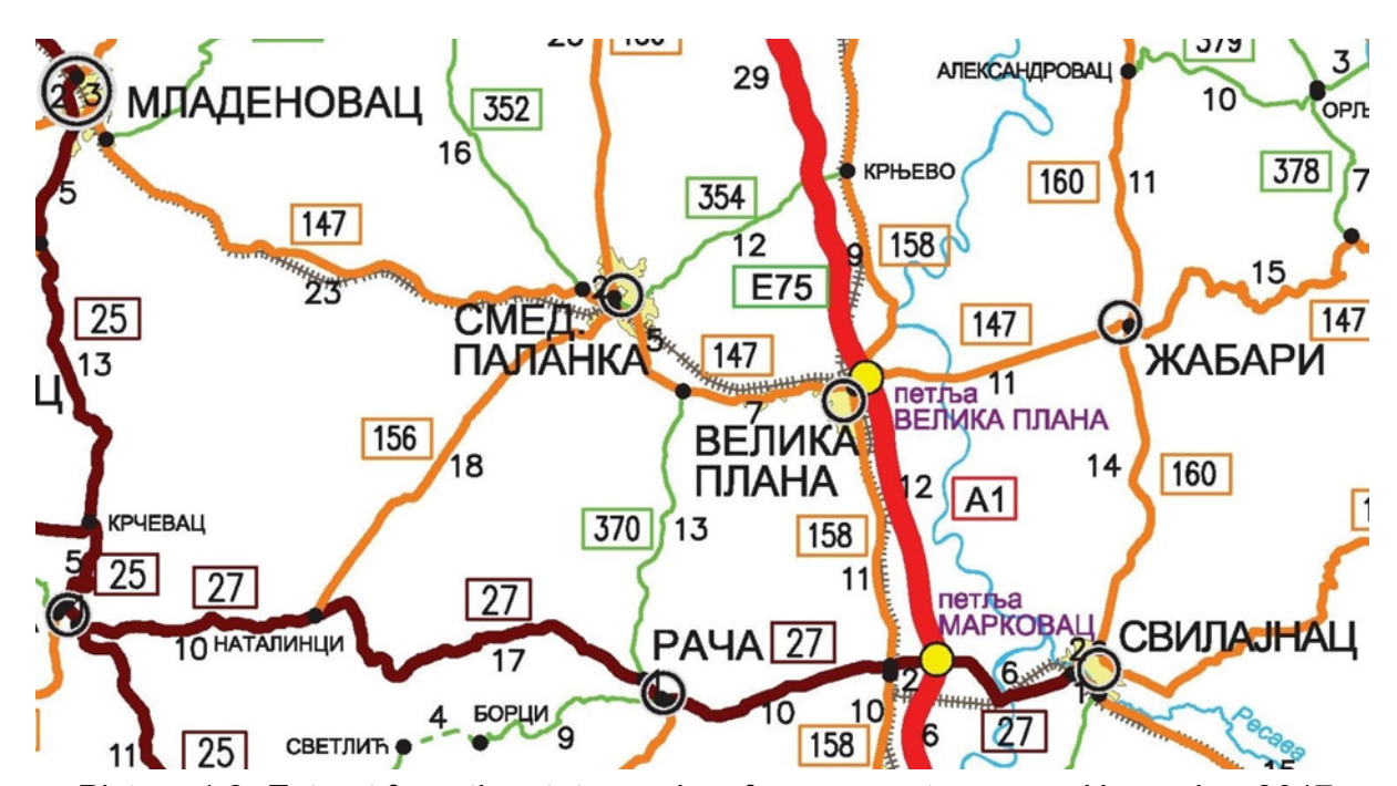
Picture 1.2: Extract from the state roads reference system map, November 2017

Contract documents, reports and correspondence in regards to the Services and contract must include reference to the name of the section defined on the cover page of the RFP. While addressing the third parties in regards to the design (state institutions for conditions,