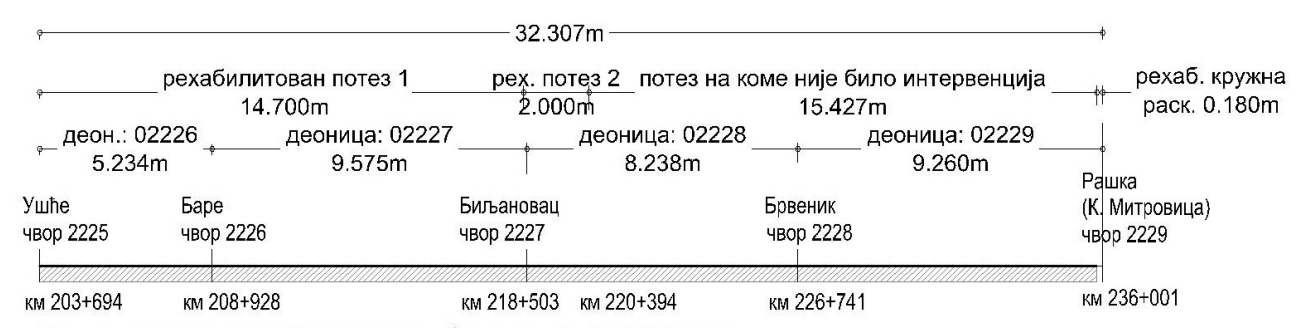
Путни потез предвиђен за рехабилитацију L=32 127m